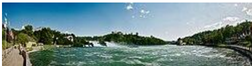
Panorama of the Rhine Falls

The Rhine Falls is one of the three largest waterfalls in Europe, along with Sarpsfossen in Norway and Dettifoss in Iceland, which is twice as high . With an average of 577 m 3 /s, the Sarpsfossen is more water-rich, but completely blocked by power plant construction. Dettifoss carries only about half as much water, but is the only one of the three falls that is completely untouched.